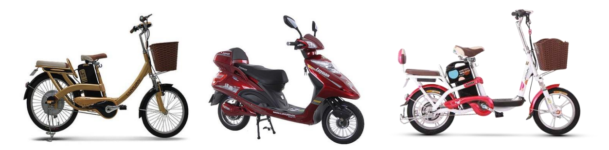
Figure 2: Two-wheel battery electric vehicle models

(From left to right: e-bike; e-scooter; hybrid model. Source: corporate product websites)