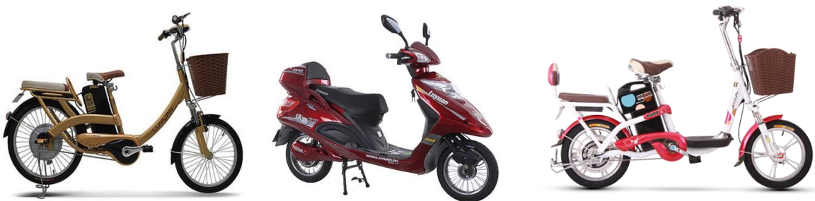
Figure 2: Two-wheel battery electric vehicle models

(From left to right: e-bike; e-scooter; hybrid model.)