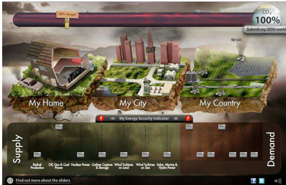
FIGURE 2: The my2050 Scenario Building Tool illustrating the 7 ‘supply side’ sliders (contains public sector information licensed under the UK’s Open Government Licence v2.0)

Postprint: Pidgeon, N.F, Demski, C.C, Butler, C., Parkhill, K. and Spence, A. 2014. Creating a national citizen engagement process for energy policy . Proceedings of the National Academy of Sciences of the United States of America 111 (Suppl) , pp. 13606-13613. 10.1073/pnas.1317512111