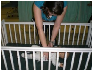
Figure 2: Finishing position