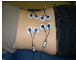
Figure 4: SEMG of abdominal muscles