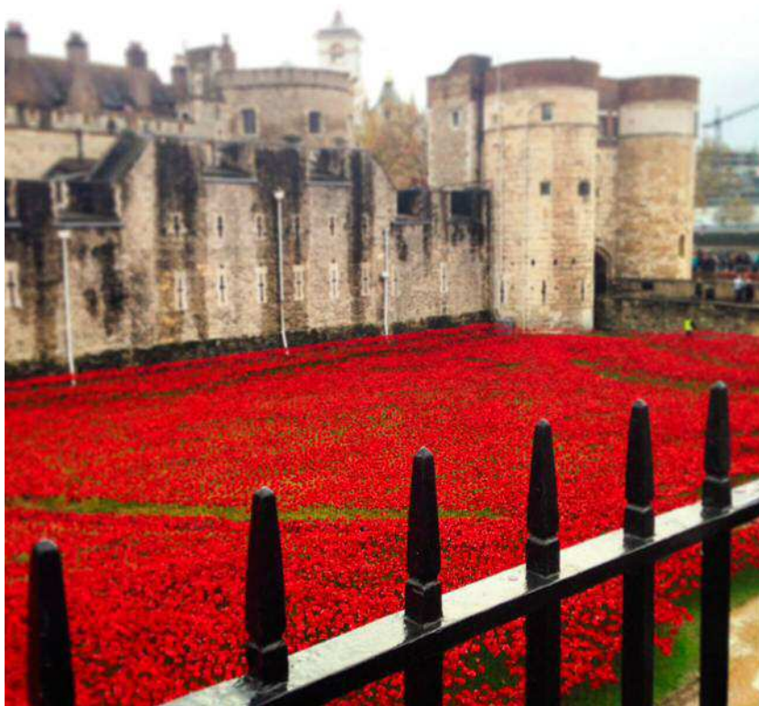
Figure 1. Blood Swept Lands and Seas of Red at the Tower of London.

installation was also notable in policy terms, as it came to be seen as a lynchpin of the centenary commemorations; a hyper-visible backdrop for politicians, the royal family and the military as they positioned themselves for public remembrance of World War 1 (WW1). In the fullness of time, this installation may well prove to have shifted expectations for large-scale commemorative activity within the UK and beyond.