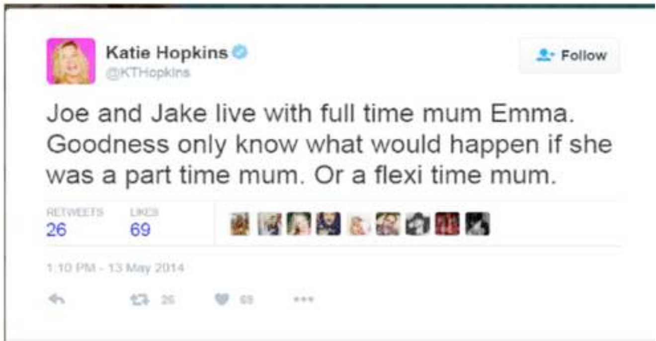
Tweet 2 (5 responses).