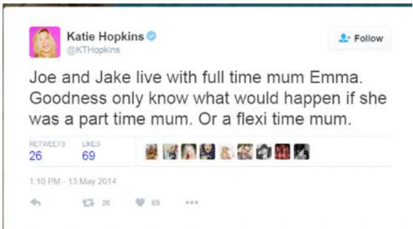
Tweet 15 (5 responses).

Tweet 13 is another example from the obesity topic collection. In this formulation, the condensed account is prefaced by an