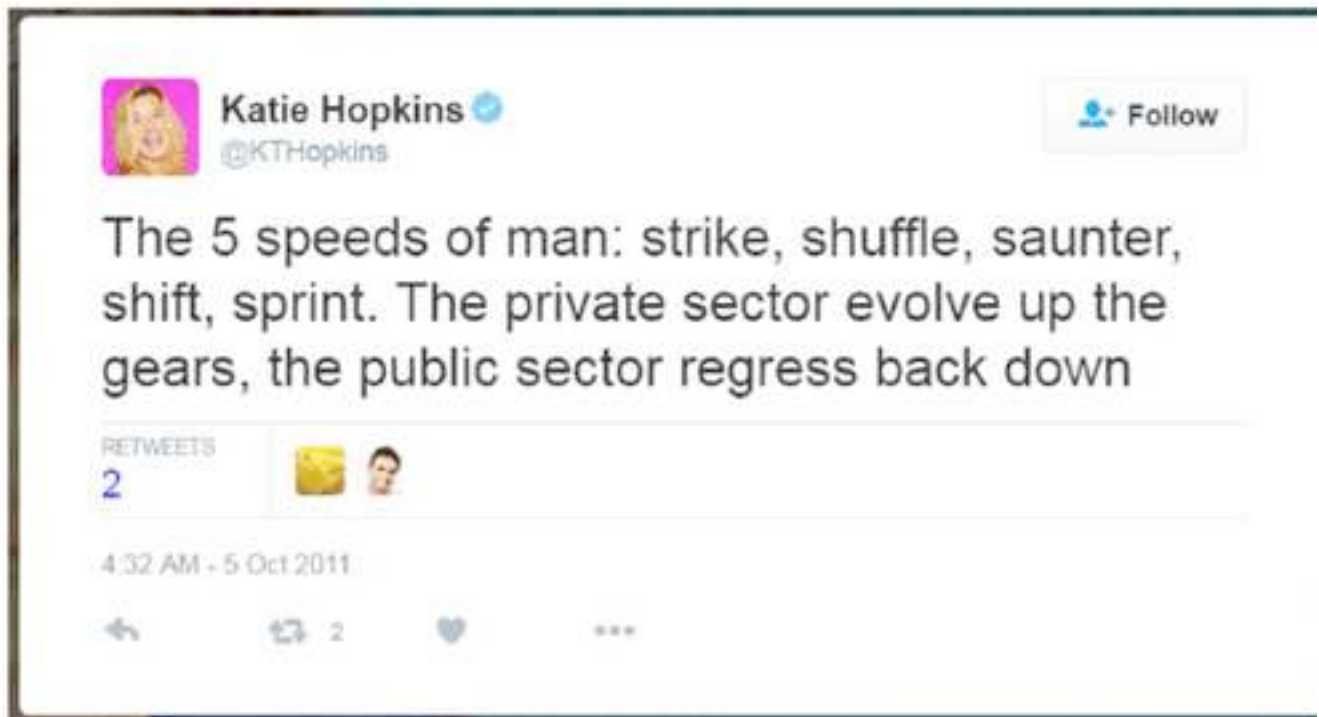
Tweet 14 (0 responses).