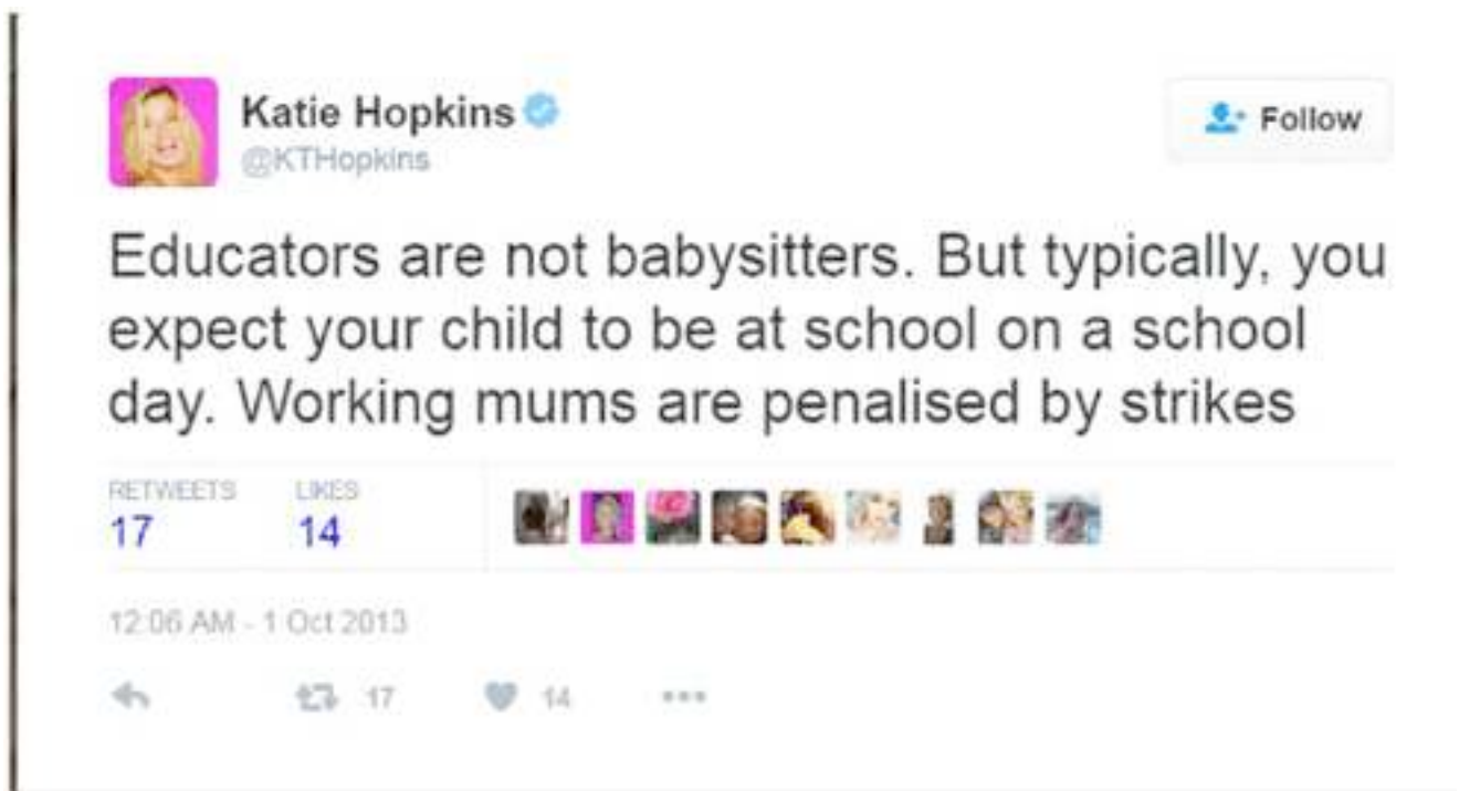
Tweet 3 (23 responses).

The tweets identified above reference a range of topics. At a very general level, we might conclude that each one (Tweets 1-3) is emotive and expresses a strong opinion that is likely to inflame others. However, in this article we argue that these